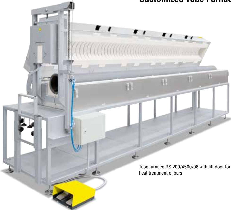
Tube furnace RS 200/4500/08 with lift door for heat treatment of bars