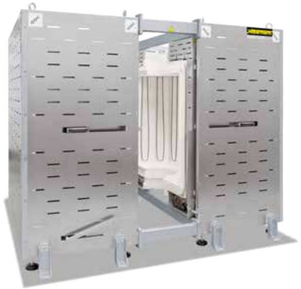
RS 460/1000/16S for integration in a production plant

With their high level of flexibility and innovation, Nabertherm offers the optimal solution for customer-specific applications.