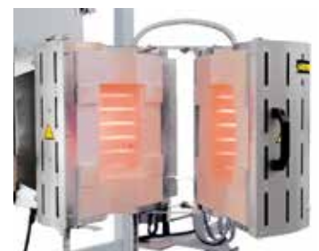
RS 100/250/11S in split-type design for integration into a test stand