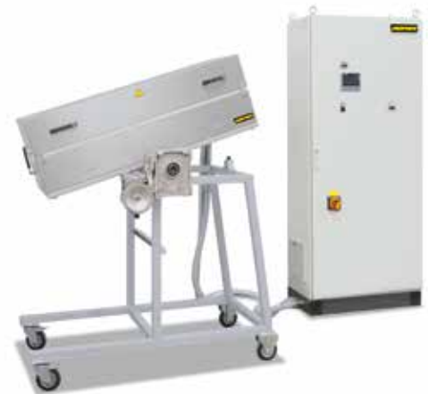
RS 120/1000/11S with bogie for different inclination angles

Based on our standard models, we develop individual solutions also for integration in overriding process systems. The solutions shown on this page are just a few examples of what is feasible. From working under vacuum or protective gas via innovative control and automation technology for a wide selection of temperatures, sizes, lengths and other properties of tube furnace systems – we will find the appropriate solution for a suitable process optimization.